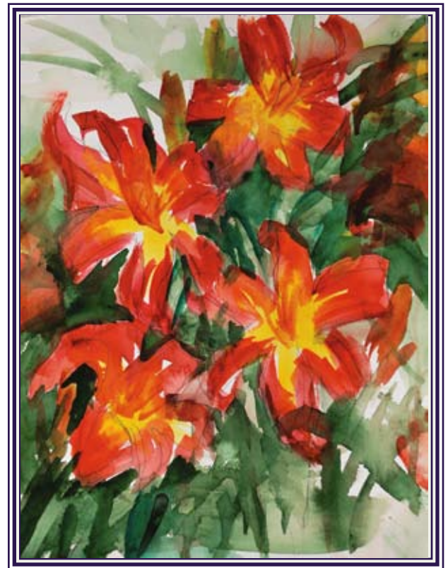
Day Lilys - Summer 2008

You will be able to purchase a thank you card next year that features one of Linnea Johnson's original watercolors. Please look for details in a future issue of INSIGHT.